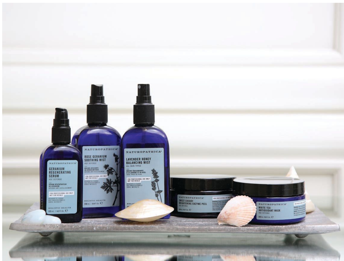
Ritz-Carlton Signature Facial products