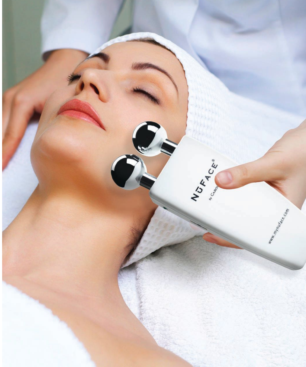
NuFACE at Laguna Image Skin Care

To enter, scan this code, or visit ocinsite.com/spagiveaway